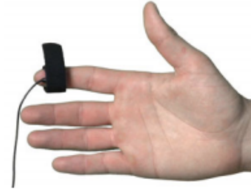
Figure 1. Positioning of Pulse Transducer.