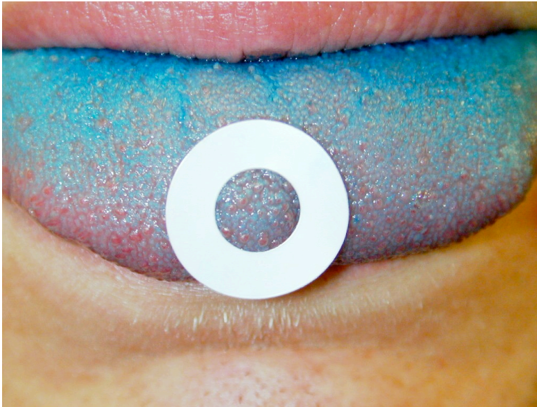
Figure 2. Adhesive reinforcement label placed on the tongue tip. Papillae are counted in the encircled area.

4. Place a reinforcement label (Figure 2) on the tongue tip (BBC 2003). Stick out your tongue to cover the lower lip. Gently close your mouth and use your teeth to hold the tongue in place. Shine a flashlight on the exposed tongue. With the 5X magnifying mirror, count the number of pink fungiform papillae in the center hole of the reinforcement label. Have your lab partner verify the count using a reading glass magnifier or by looking over your shoulder into the mirror. Record the number.