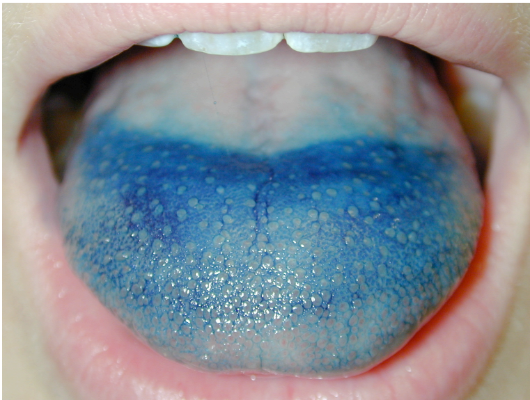
Figure 1. Anterior tongue stained with blue food coloring. Fungiform papillae appear pink against the background of blue filiform papillae.