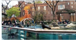
Seals (left, Maritime Aquarium) Sea lions above and below (Central and Prospect Park Zoos)