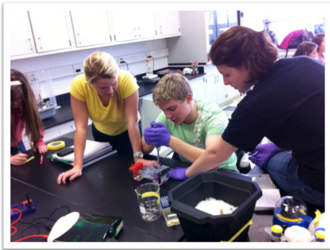
Figure 1. Student groups of four are assigned a bench space and set of equipment. In the photo, these students work in the cell and molecular biology laboratory and they have a set of pipetmen, a vortex, ice bucket, power supply, gel box, micro-centrifuge, labeling tape, sharpie markers, etc. Notice that the benches are designed for teams of four students, with no physical barriers and plenty of space.

In order to form functional teams, and solicit and collect feedback to track their success during the semester, we use