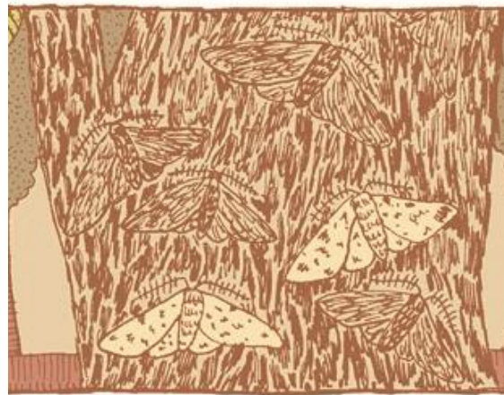
Figure 3. Light and dark Biston betularia moths on dark bark.

The light-colored lichen growing on the tree trunks died as a result of air pollution during the industrial revolution. The bark returned to its natural dark brown color and the selective values of the moth color were reversed. The dark moths were well hidden from birds, while the moths rested on the darkened tree trunks, but the light moths were now more visible to birds (Fig. 3). As a result, the dark moths survived more often and produced more offspring. Since the color differences of the moths are genetically based traits, this natural selection resulted in a dramatic increase in the frequency of the dark moths. In 1850, dark Biston betularia were sought after by collectors and approximately 4% of their collections were composed of dark moths. After 50 years, which equals 50 generations of the moth, 95% of the collections were made up of dark moths. The color of Biston betularia had evolved in response to natural selection.