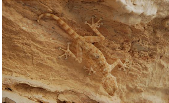
Figure 2. An example of crypsis.

Many animals, including insects, reptiles, and mammals, have evolved cryptic color patterns (Fig. 2). Cryptic color patterns are types of natural camouflage that allow individuals to blend into their habitat. Crypsis is adaptive because it reduces predation—if they can't see you, they can't eat you.