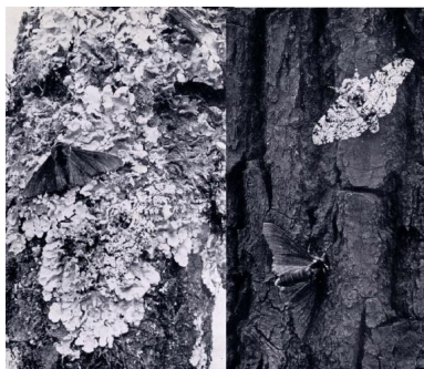
Figure 1. Black and white beans will be used to represent dark and light moths, Biston betularia .

In this simulation, you will use black and white beans to represent dark-colored and light-colored moths (Fig. 1). You will randomly determine which individual moths survive to produce the next generation. In some generations, many individuals will survive to produce the next generation; in other generations, only a few individuals will be lucky enough to survive and contribute to the next generation. This will allow you to contrast the effect of genetic drift on small and large populations.