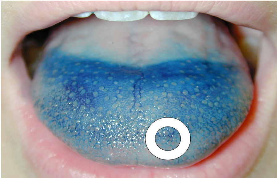
Figure 1. Anterior tongue stained with blue food coloring. Non-staining fungiform papillae appear pink against the blue background of stained filiform papillae. The adhesive reinforcement label is placed on the tongue tip. Papillae are counted in the encircled area.

5. Place a reinforcement label (Fig. 1) over the blue stained area (BBC, 2003). Stick out your tongue to cover the lower lip. Gently close your mouth and use your teeth to hold your tongue in place. Shine a flashlight on the exposed tongue. With the 10x magnifying mirror, count the number of pink fungiform papillae in the center hole of the reinforcement label. Have your lab partner verify the count by looking over your shoulder into the mirror. Record the number (Table 1).