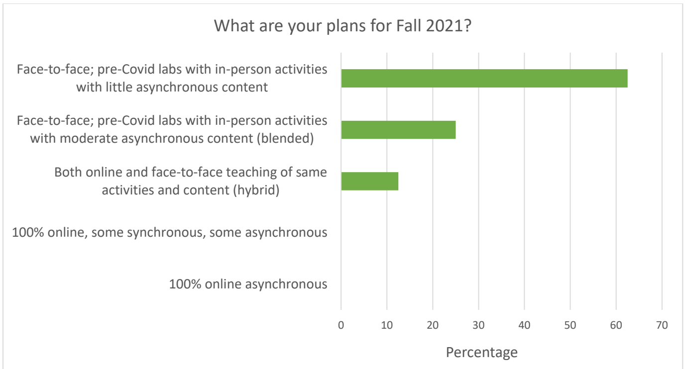
Figure 2. Responses of panelists and discussion panel participants to poll Question 2 preceding discussion.