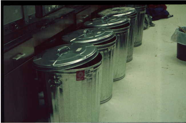
Figure 3. Large sections of termite-infested logs placed in loosely-tied large plastic lawn bags stored in 29-gallon galvanized steel garbage cans for long term storage in the lab (months to years).